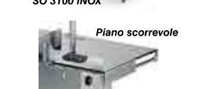
SO 3100 INOX