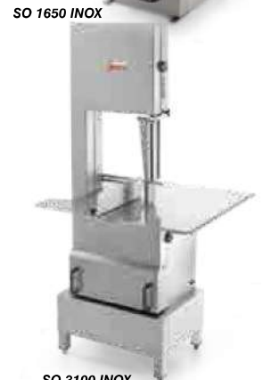
SO 1650 INOX