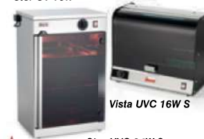
Vista UVC 16W S