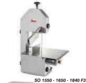
SO 1550 - 1650 - 1840 F3