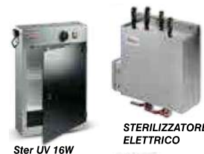
Ster UV 16W