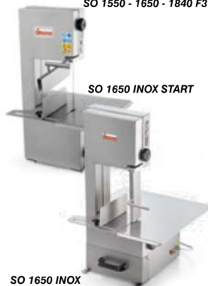
SO 1650 INOX START